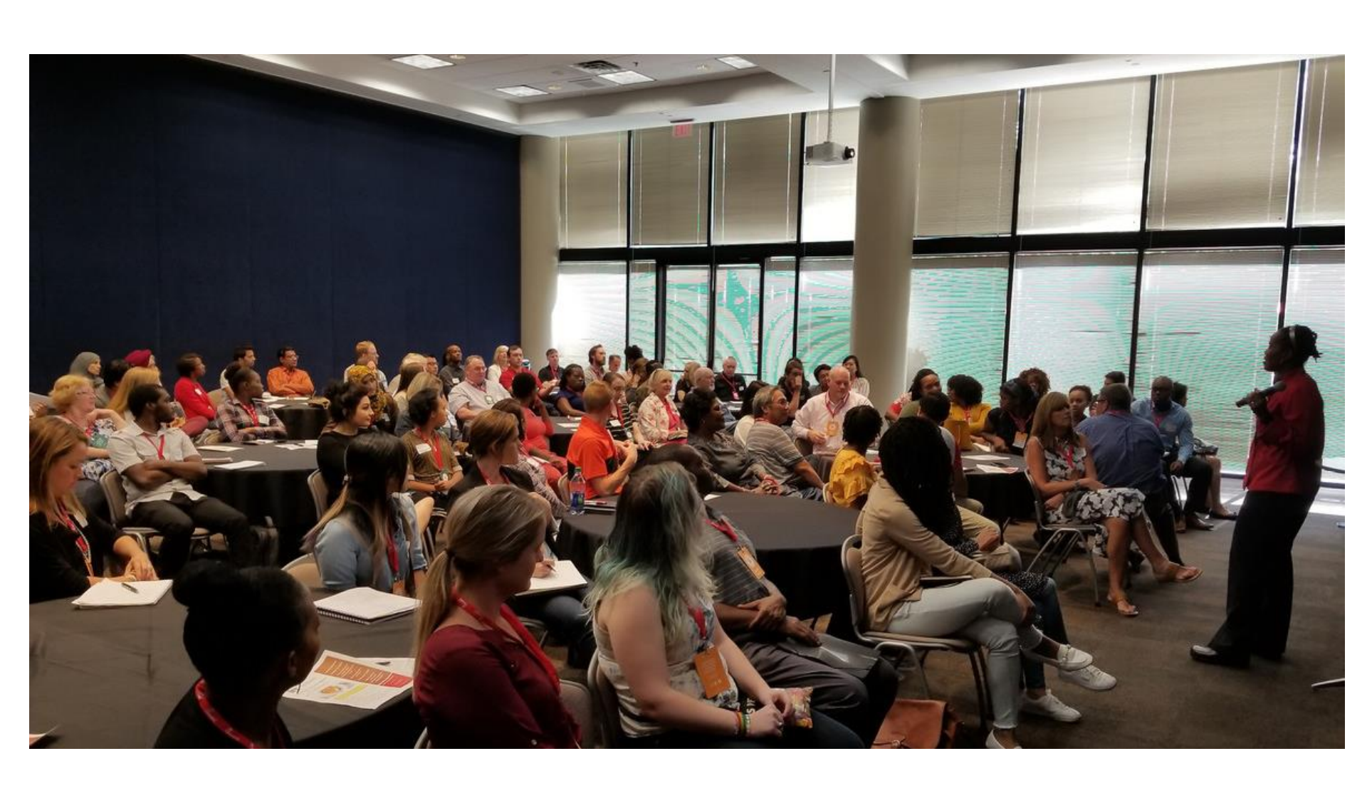
South Eastern Section IFT (SEIFT) Fall 2018 Meeting and Chick-Fil-A Backstage Tour The Chick-Fil-A Support Center, 5200 Buffington Road, Atlanta, GA 30349, on September 21, 2018