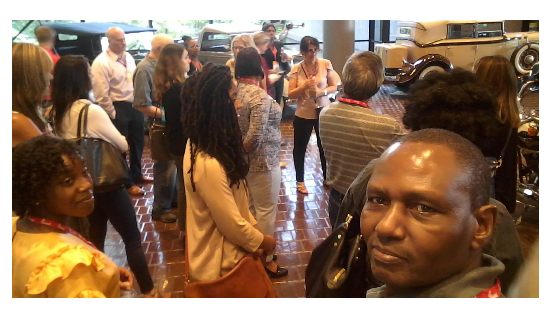
South Eastern Section IFT (SEIFT) Fall 2018 Meeting and Chick-Fil-A Backstage Tour The Chick-Fil-A Support Center, 5200 Buffington Road, Atlanta, GA 30349, on September 21, 2018