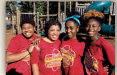
"Preparing the Next Generation of Research Scientists and Engineers"