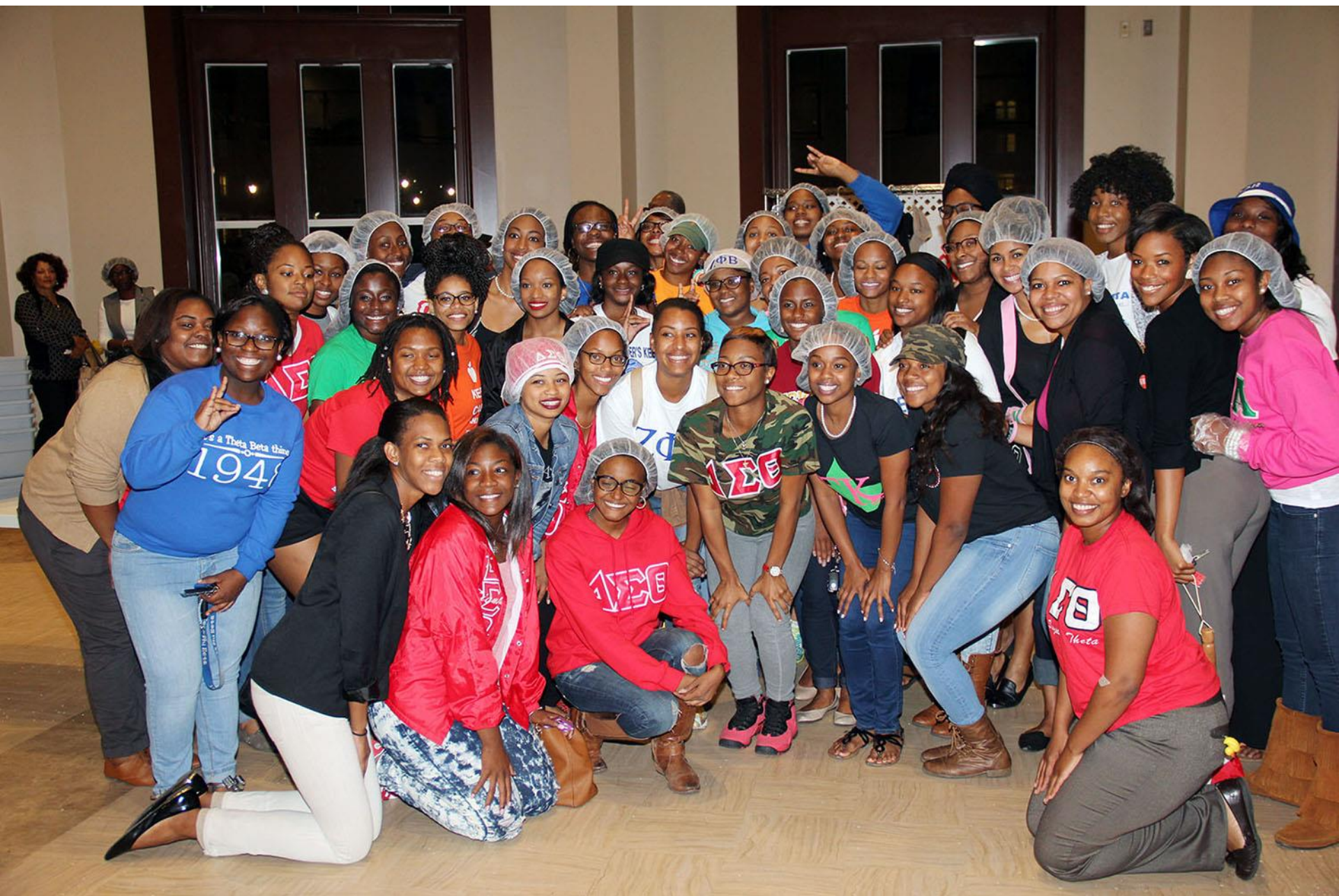
STOP HUNGER NOW Meal Packaging Event at Tuskegee University Organized by Department of Food and Nutritional Sciences & Food and Nutritional Sciences Advisory Board, October 29, 2014