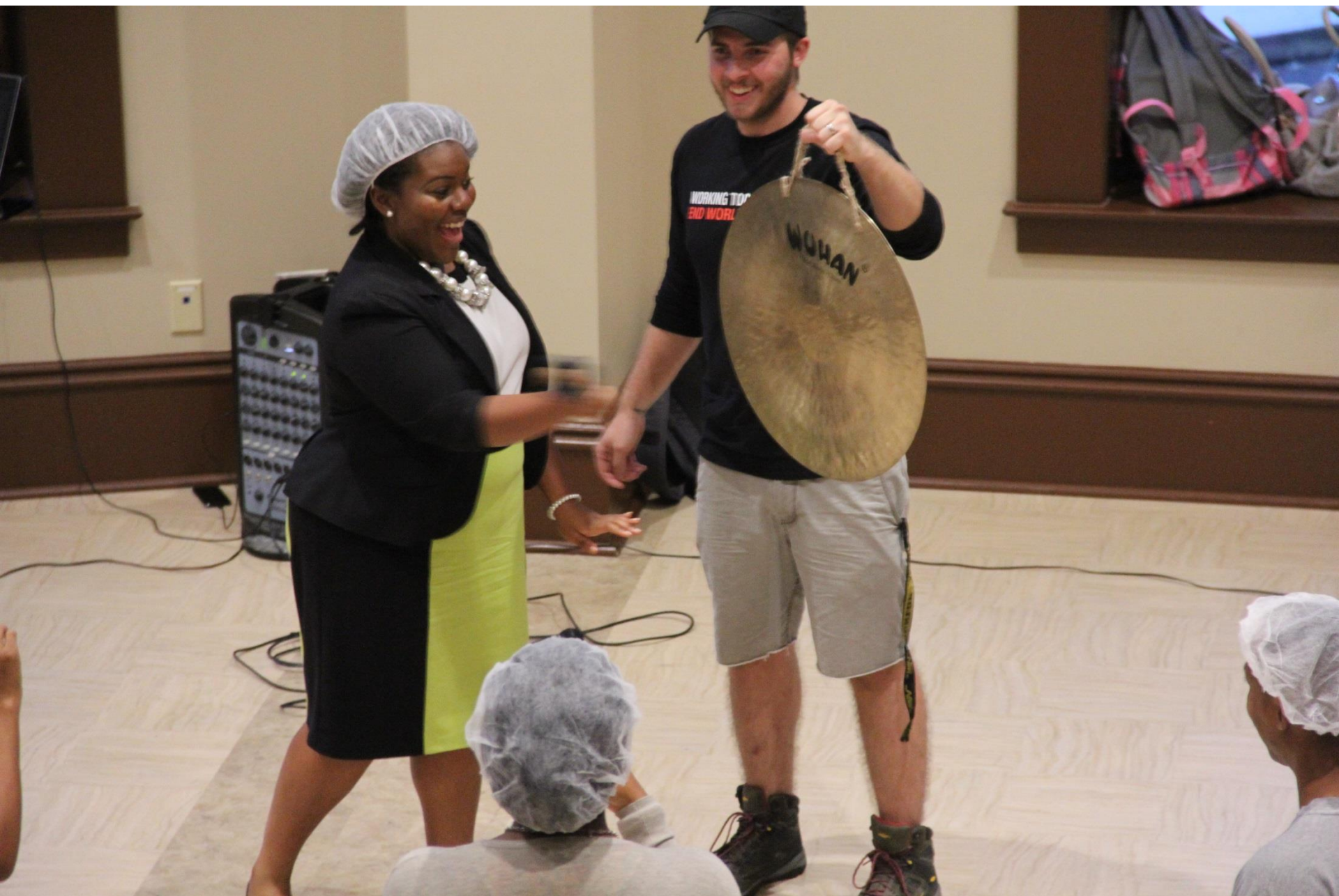
STOP HUNGER NOW Meal Packaging Event at Tuskegee University Organized by Department of Food and Nutritional Sciences & Food and Nutritional Sciences Advisory Board, October 29, 2014