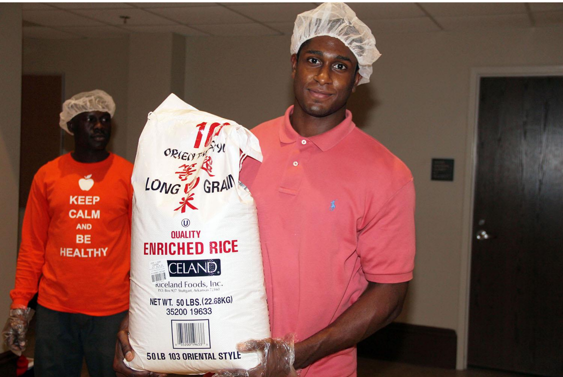
STOP HUNGER NOW Meal Packaging Event at Tuskegee University Organized by Department of Food and Nutritional Sciences & Food and Nutritional Sciences Advisory Board, October 29, 2014