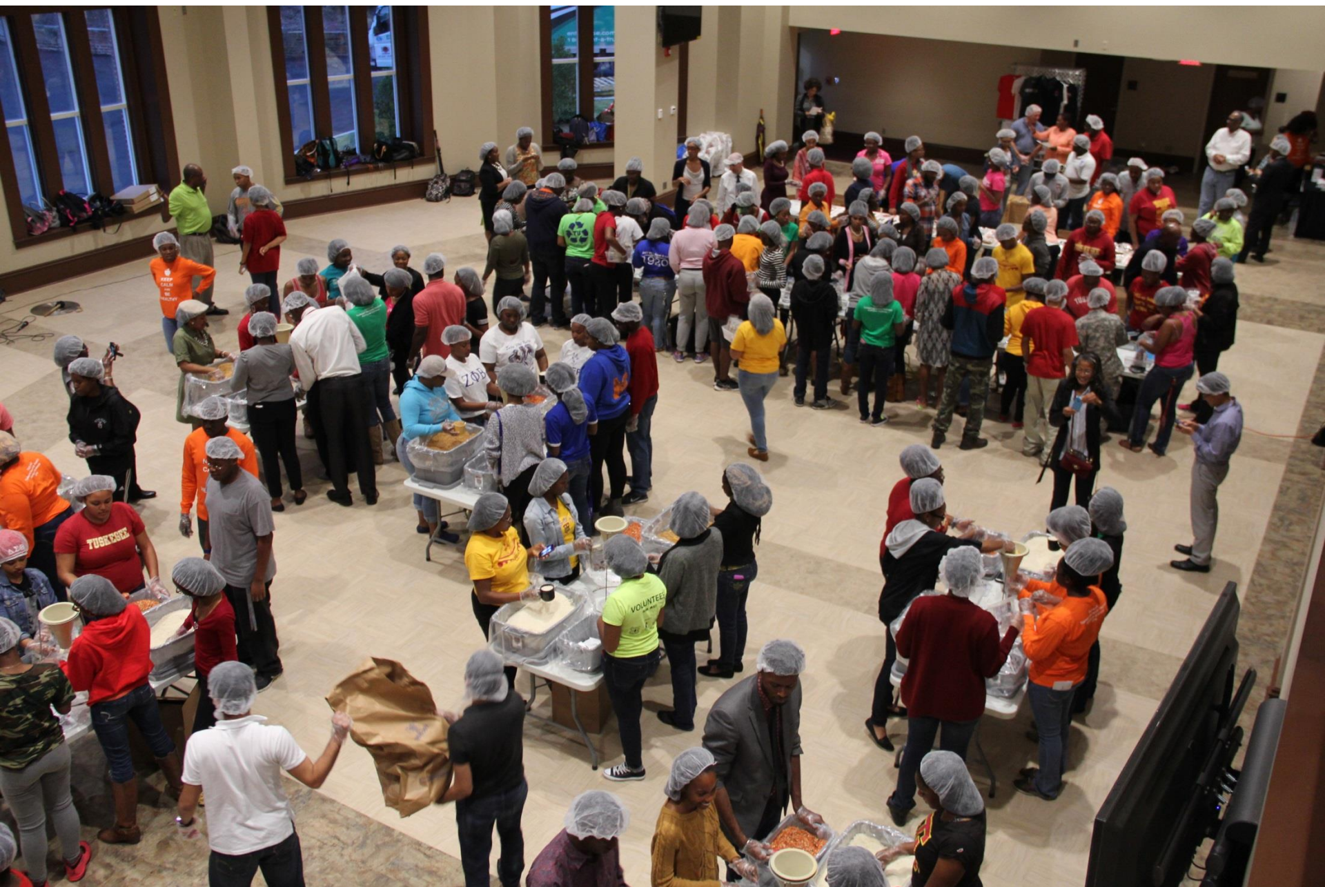
STOP HUNGER NOW Meal Packaging Event at Tuskegee University Organized by Department of Food and Nutritional Sciences & Food and Nutritional Sciences Advisory Board, October 29, 2014