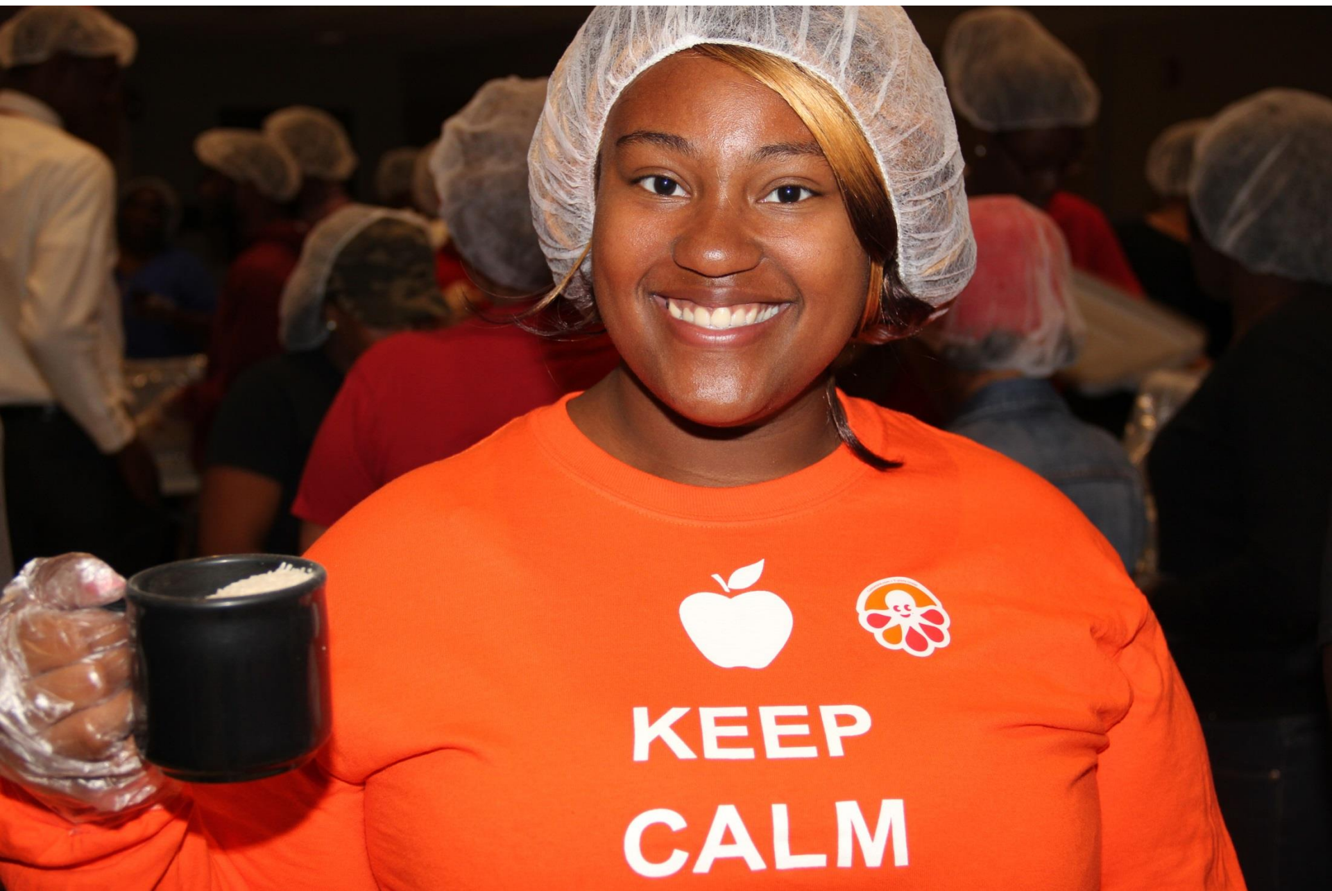
STOP HUNGER NOW Meal Packaging Event at Tuskegee University Organized by Department of Food and Nutritional Sciences & Food and Nutritional Sciences Advisory Board, October 29, 2014