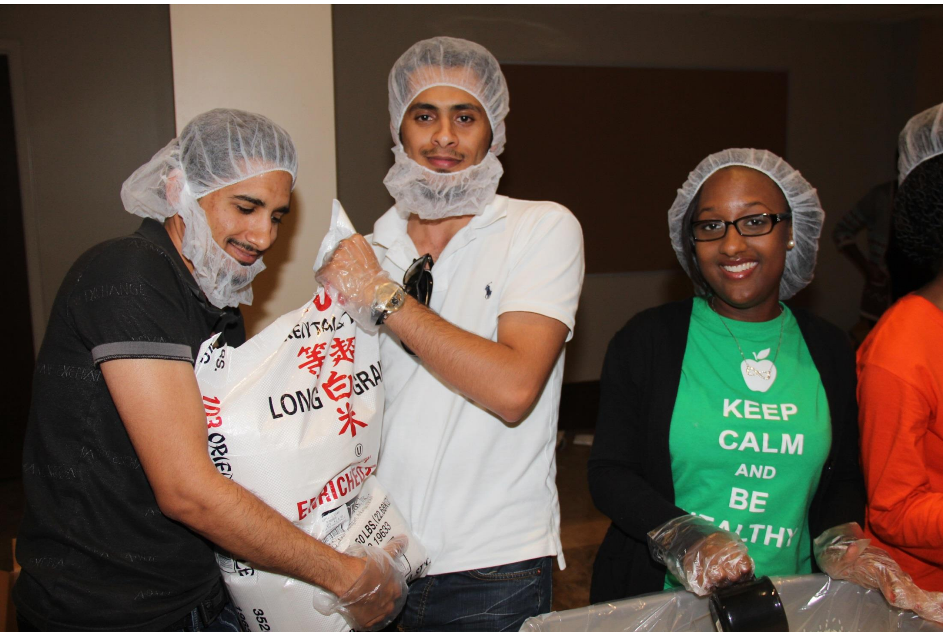
STOP HUNGER NOW Meal Packaging Event at Tuskegee University Organized by Department of Food and Nutritional Sciences & Food and Nutritional Sciences Advisory Board, October 29, 2014