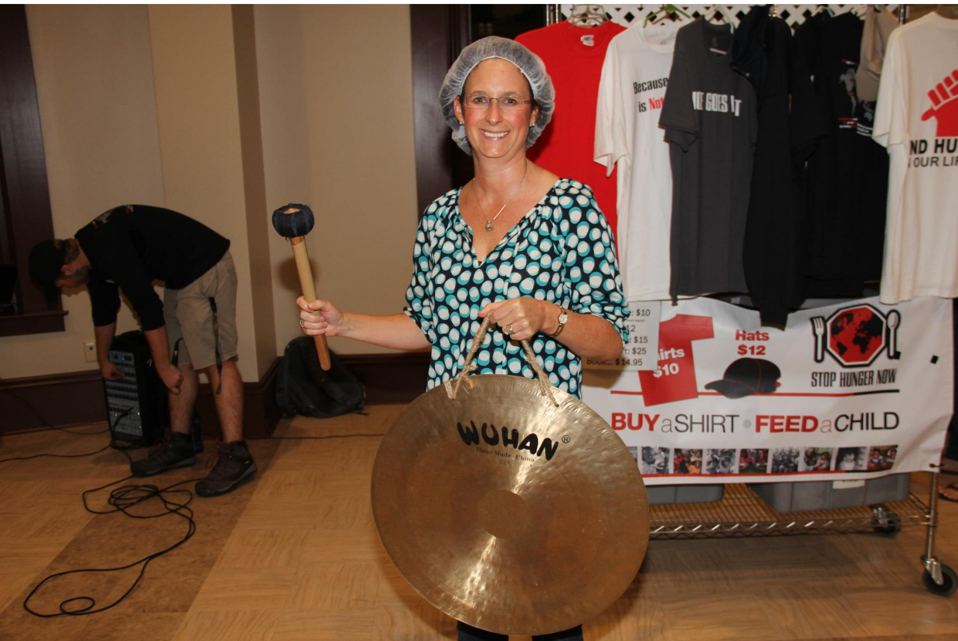
STOP HUNGER NOW Meal Packaging Event at Tuskegee University Organized by Department of Food and Nutritional Sciences & Food and Nutritional Sciences Advisory Board, October 29, 2014