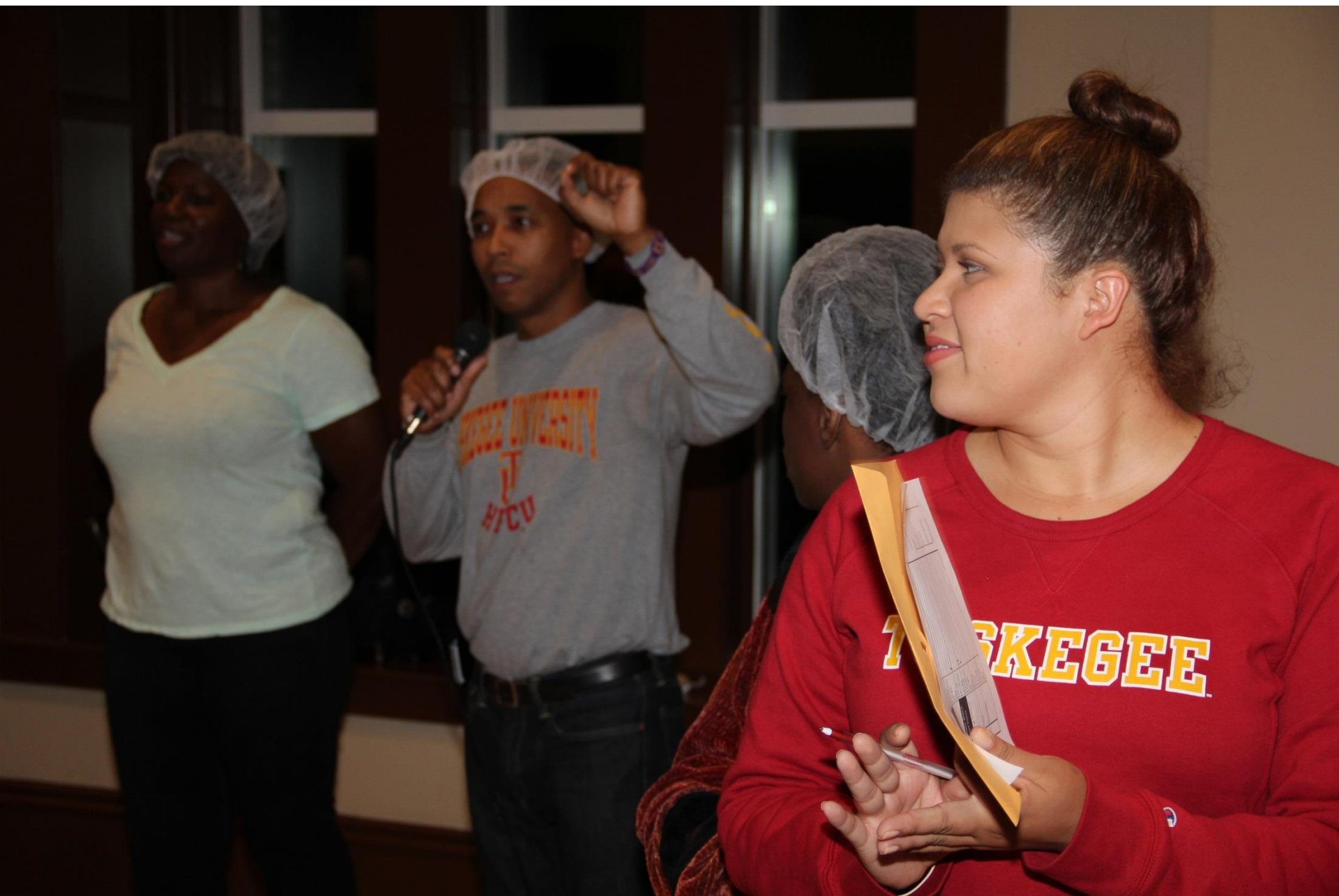
STOP HUNGER NOW Meal Packaging Event at Tuskegee University Organized by Department of Food and Nutritional Sciences & Food and Nutritional Sciences Advisory Board, October 29, 2014