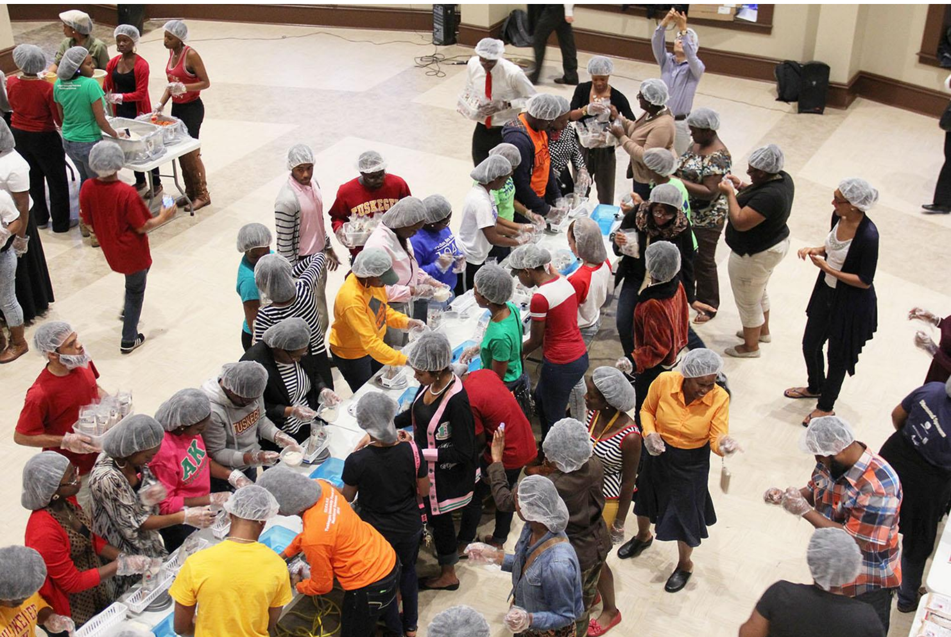
STOP HUNGER NOW Meal Packaging Event at Tuskegee University Organized by Department of Food and Nutritional Sciences & Food and Nutritional Sciences Advisory Board, October 29, 2014