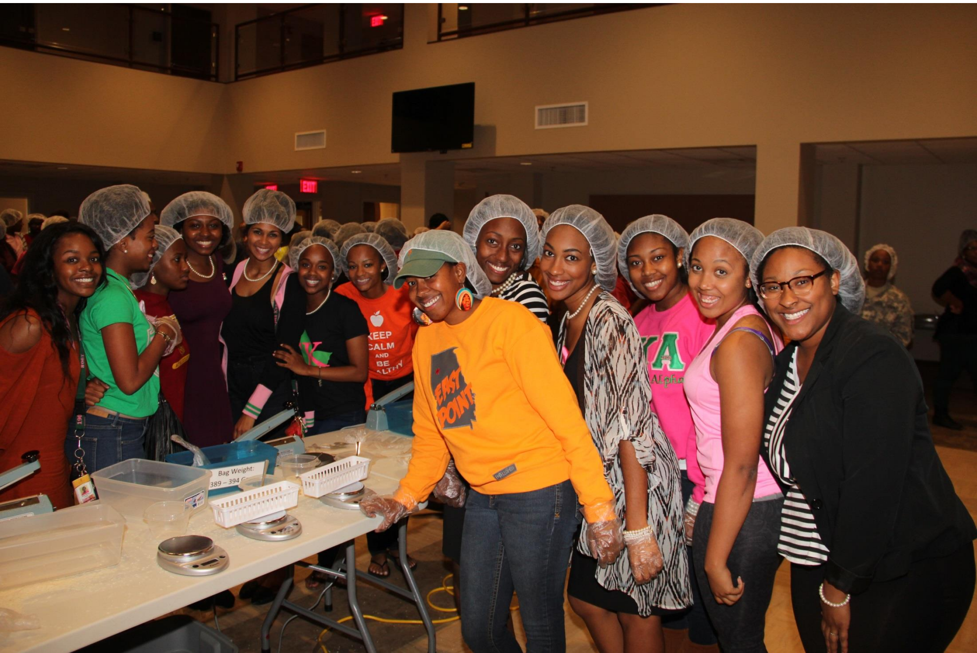
STOP HUNGER NOW Meal Packaging Event at Tuskegee University Organized by Department of Food and Nutritional Sciences & Food and Nutritional Sciences Advisory Board, October 29, 2014