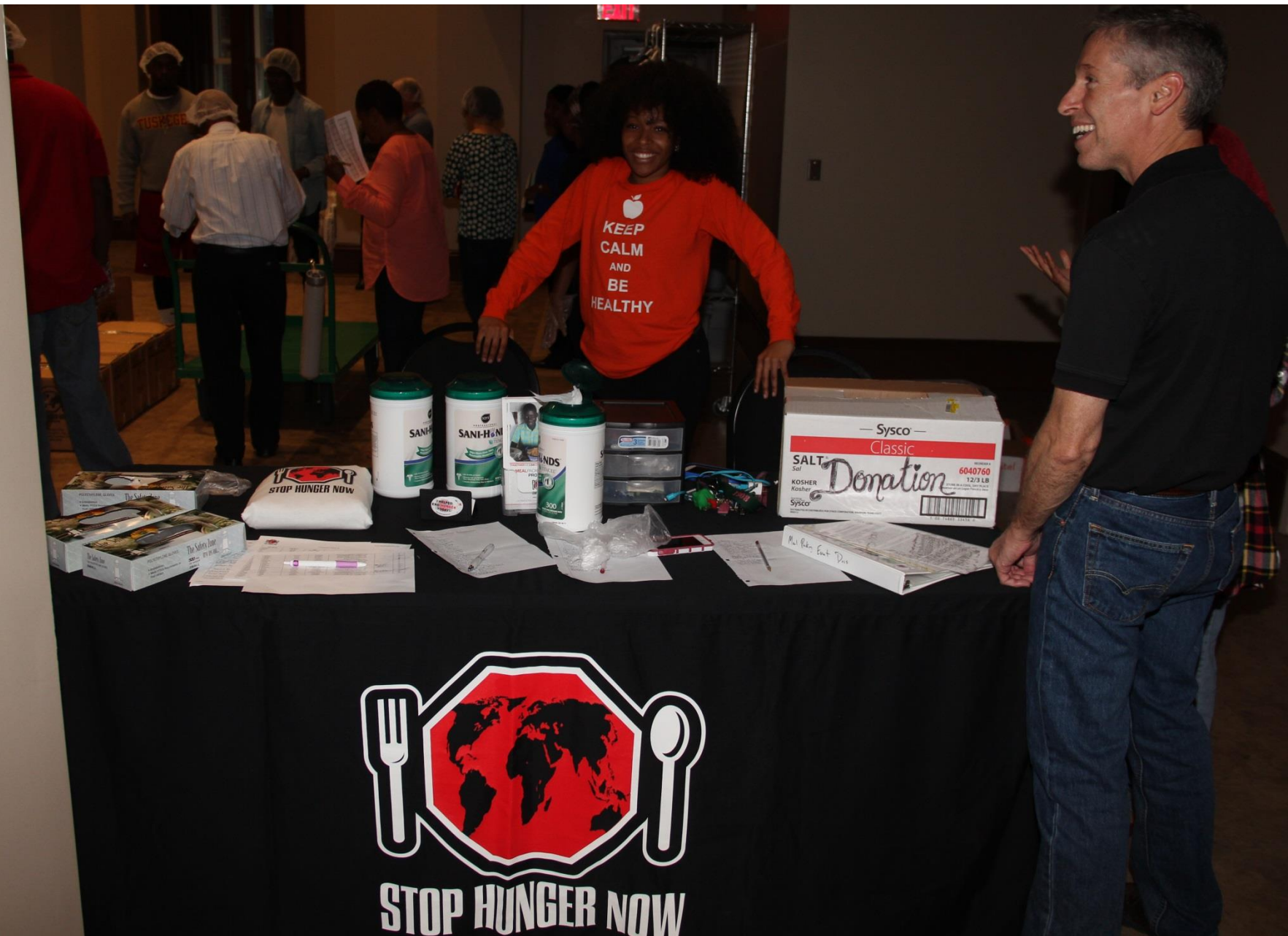
STOP HUNGER NOW Meal Packaging Event at Tuskegee University

Organized by Department of Food and Nutritional Sciences & Food and Nutritional Sciences Advisory Board, October 29, 2014