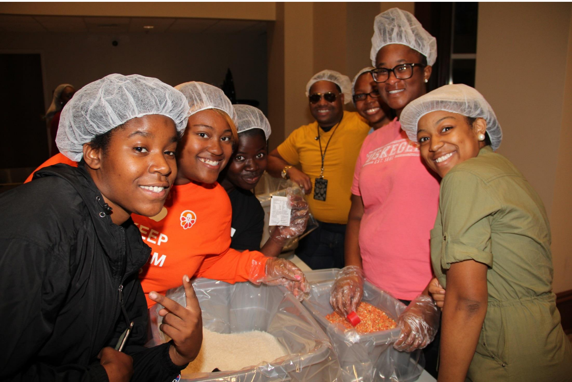
STOP HUNGER NOW Meal Packaging Event at Tuskegee University Organized by Department of Food and Nutritional Sciences & Food and Nutritional Sciences Advisory Board, October 29, 2014