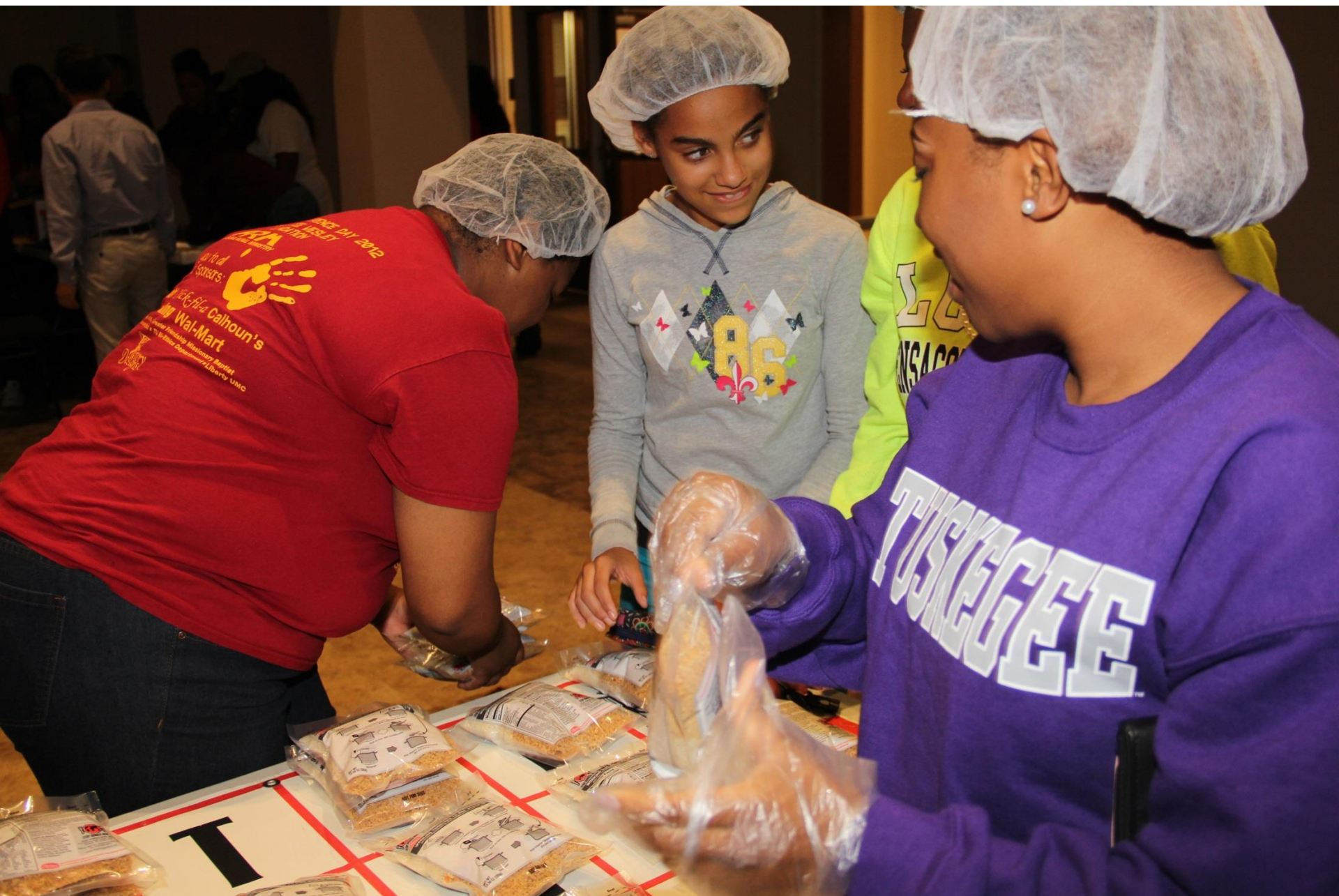
STOP HUNGER NOW Meal Packaging Event at Tuskegee University Organized by Department of Food and Nutritional Sciences & Food and Nutritional Sciences Advisory Board, October 29, 2014