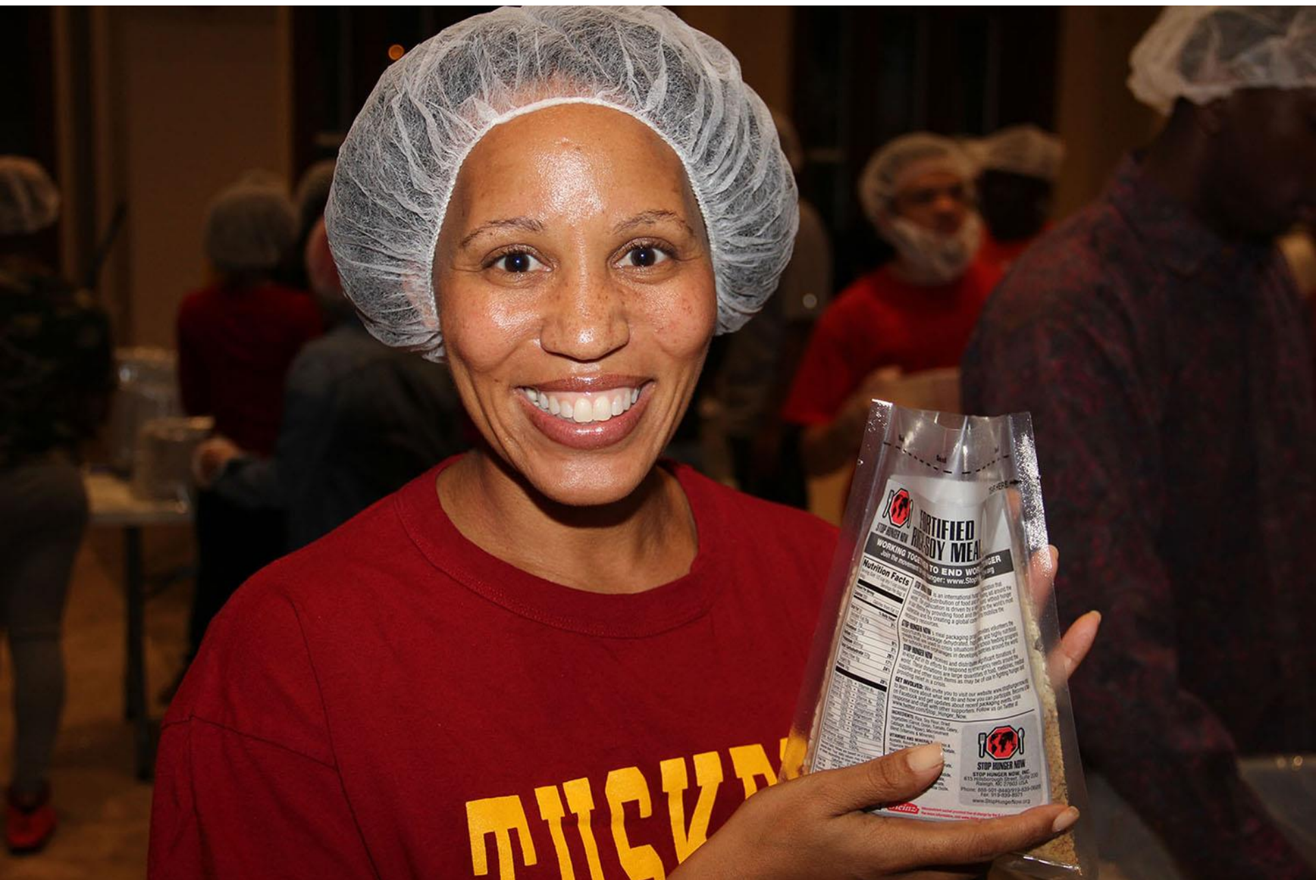
STOP HUNGER NOW Meal Packaging Event at Tuskegee University

Organized by Department of Food and Nutritional Sciences & Food and Nutritional Sciences Advisory Board, October 29, 2014