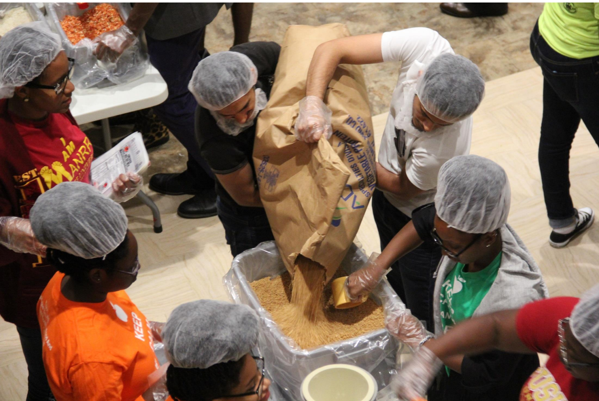
STOP HUNGER NOW Meal Packaging Event at Tuskegee University Organized by Department of Food and Nutritional Sciences & Food and Nutritional Sciences Advisory Board, October 29, 2014